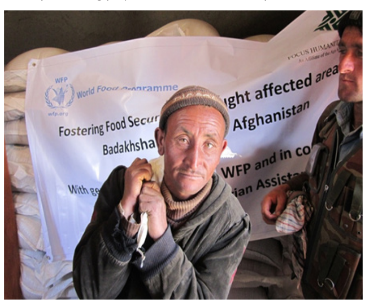
An Afghan farmer receiving food aid.

include the promotion of interregional coordination in agricultural research, which encourages investment in diversified and stable food crops, and increasing the level of community involvement in this process.