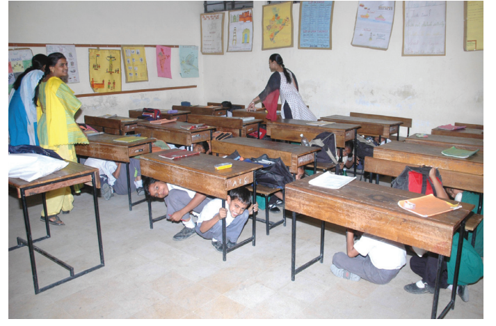
School children take cover during an earthquake drill

According to the United Nations International Strategy for Disaster Reduction, more than one-third of all earthquakes that took place between 1991 and 2005 occurred in Central and South Asia. Consequently, the AKDN has launched an initiative aimed at countries such as Afghanistan, India, Pakistan and Tajikistan – which are particularly vulnerable – to enhance and develop institutional capacity to maximise the mitigation of the risks associated with disaster, and encourage preparedness.