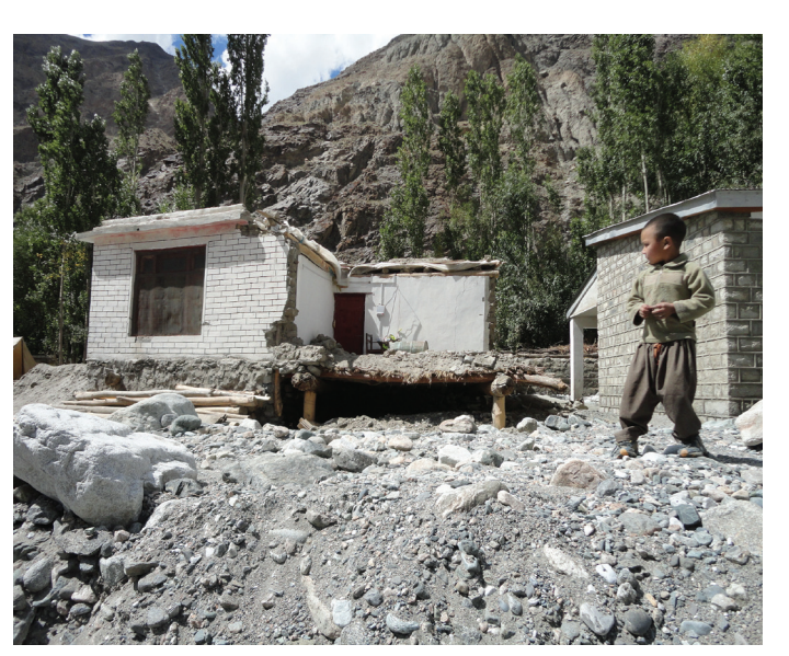
A child stands before his collapsed home