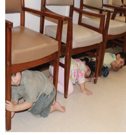
ShakeOut participants of all ages!

and sponsors who supported them so generously!