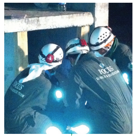
USAR teams during the simulation

The 2011 Challenge saw participants from Canada, England, Kenya and the United States attempt to reach the Peak of Africa. Flight cancellations and delays resulted in the group having to begin their hike a mere five hours after landing in Tanzania. Despite the rain and cold, the group rallied together as they progressed on the climb, and on 31 December 2011, 40 out of 44 participants made it to Gilman's Point, at a height of 5,681m. Thirty eight of these intrepid participants continued to Uhuru Peak, the highest point in Africa, which stands at an incredible 5,895m above sea level! The ascent is a virtual climatic world tour, ranging from the tropics to the Arctic, making it one of the most breathtaking and difficult – climbs in the world. We congratulate the team for successfully embracing this challenge and thank all donors